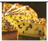
Cheesecake Choices (16)