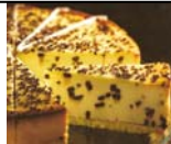
Cheesecake Choices (16)