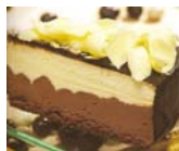
3 Chocolate Mousse (12)